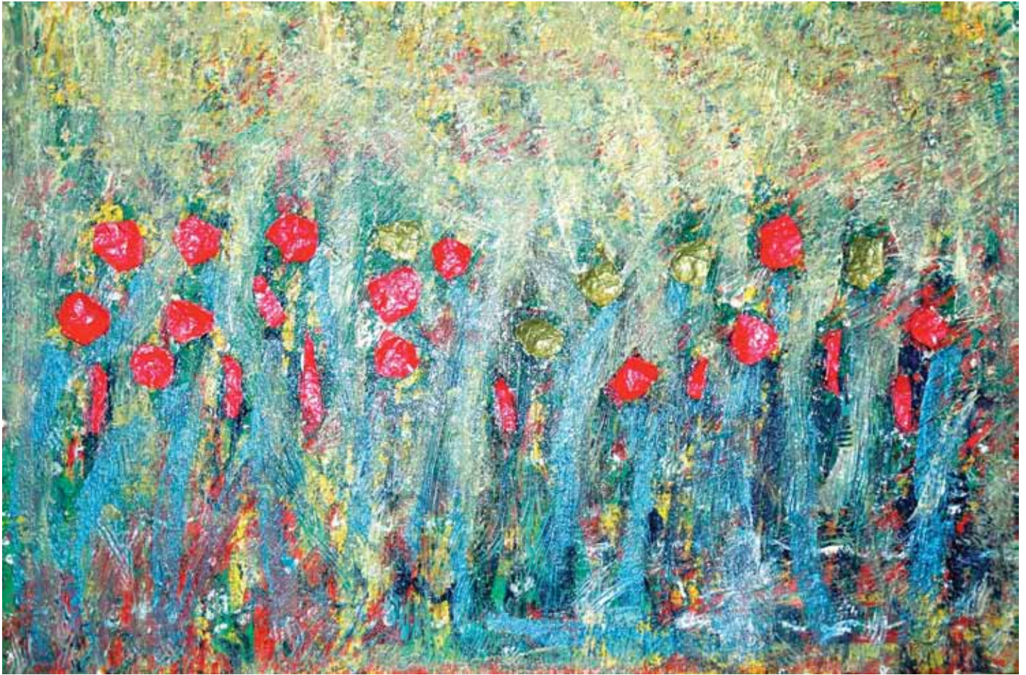
Garden of Flowers